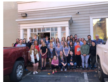
2023 RCPC Youth delivering items to HAT