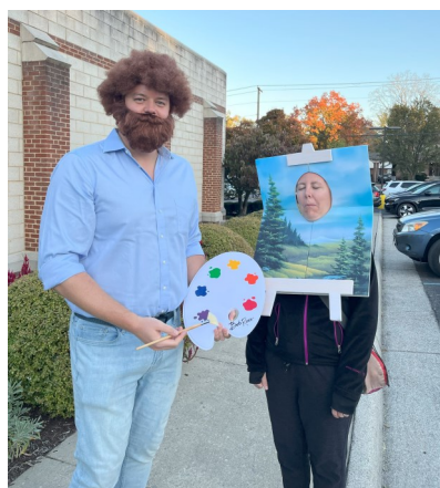
Fall Festival & Organ Spooktacular!