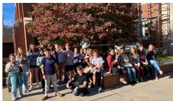
RCPC Youth enjoying popsicles after HAT flyer distribution!

Each week we'll watch 30 minutes of this Christmas Classic and then discuss connections between the film and our faith! The film will begin at 10:05 AM on the dot giving students time to make their cups of hot cocoa and to provide time for conversation at the end. You won't want to miss it!